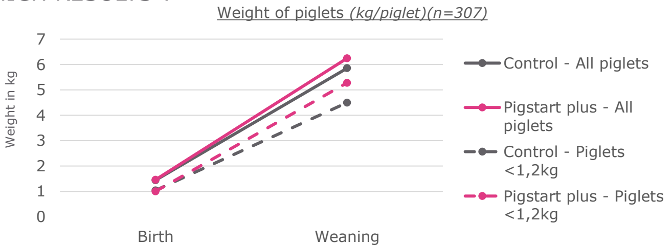
Figure 1: Evolution of the weight (21 days) (France, 2015)