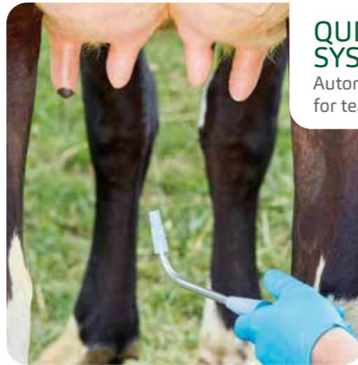
QUICK SPRAY SYSTEM Automaton for teats disinfection